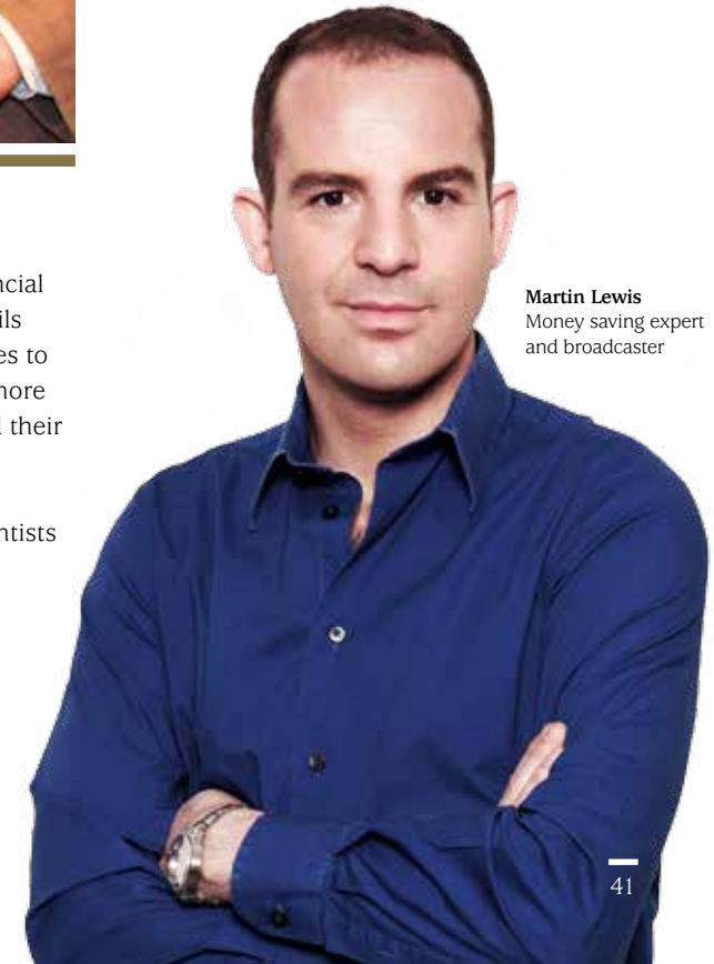
Martin Lewis Money saving expert and broadcaster

Visitors like Martin Lewis, TV and financial celebrity, are an inspiration to our pupils and show them there are no boundaries to where they can go in life. To find out more about some of our famous Alumni and their often fascinating stories visit: www.kingschester.co.uk and click on Notable Alumni. From pioneering scientists and war heroes to an Elizabethan double-agent doctor, there are some colourful tales to tell!