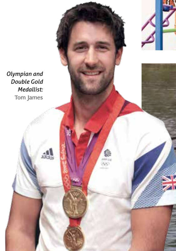
Olympian and Double Gold Medallist: Tom James

King's has particular strengths in football, hockey, netball and rowing, winning many regional and national trophies. We are involved in developing national school strategies for hockey and football, too. But whichever sport a student chooses, our highly qualified and committed sports teachers will encourage them to work hard to get better.