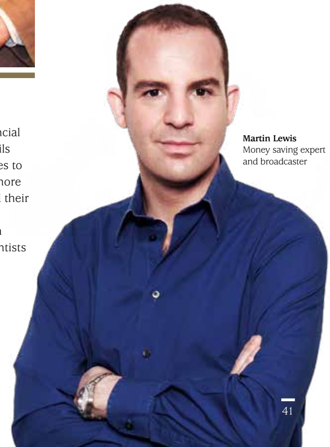
Martin Lewis Money saving expert and broadcaster

Visitors like Martin Lewis, TV and financial celebrity, are an inspiration to our pupils and show them there are no boundaries to where they can go in life. To find out more about some of our famous Alumni and their often fascinating stories visit: www.kingschester.co.uk and click on Notable Alumni. From pioneering scientists and war heroes to an Elizabethan double-agent doctor, there are some colourful tales to tell!