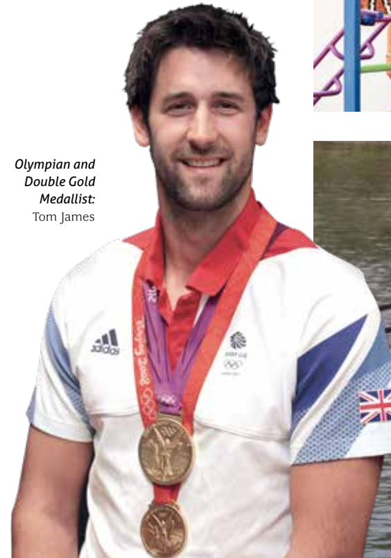
Olympian and Double Gold Medallist: Tom James

King's has particular strengths in football, hockey, netball and rowing, winning many regional and national trophies. We are involved in developing national school strategies for hockey and football, too. But whichever sport a student chooses, our highly qualified and committed sports teachers will encourage them to work hard to get better.